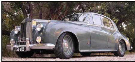
1958 Rolls Royce "Derelict" by ICON